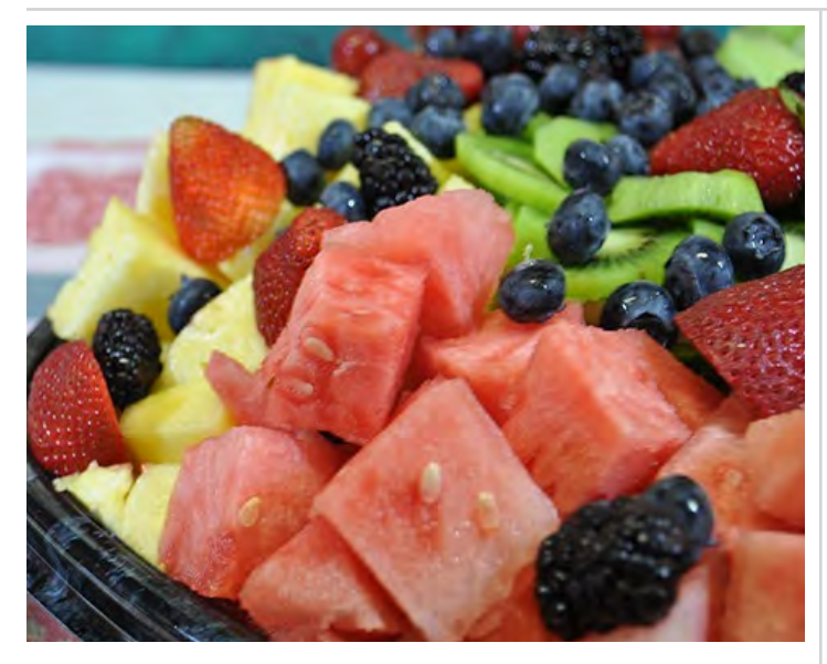
Fresh Fruit Platter

Delicious Seasonal Fruit selections, beautifully arranged around Fruit Dip.