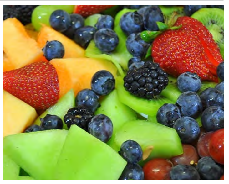
Fresh Fruit Bowl

Small Platter $40, serves 12-16 Large Platter $50, serves 25-30